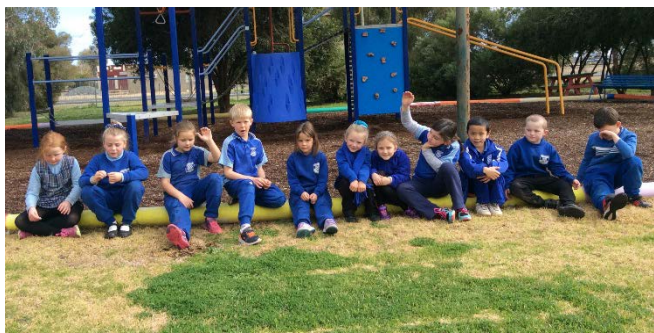
K-2 Science talks!

We have been focusing on addition and subtraction over the past two weeks. They have been relating addition facts to subtraction and working on learning a range of strategies to help them solve simple addition and subtraction problems.