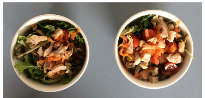
New canteen Items – Chicken Salad Bowls

We are looking forward to another wonderful day of socialising and games.