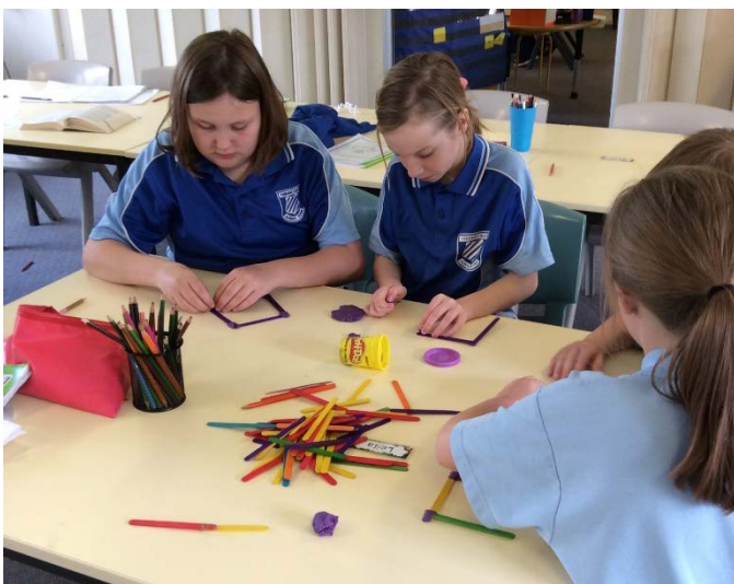
3D maths lesson

The assembly for families and friends will be held on Tuesday 21 st August at 2.45pm. Students will receive their awards and entertain our guests with a small performance.