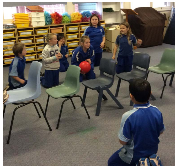
Wet weather indoor volleyball

We will hold a stall on Wednesday 29 August for students to purchase items for Father's Day. Items will be priced from $1 to $5.